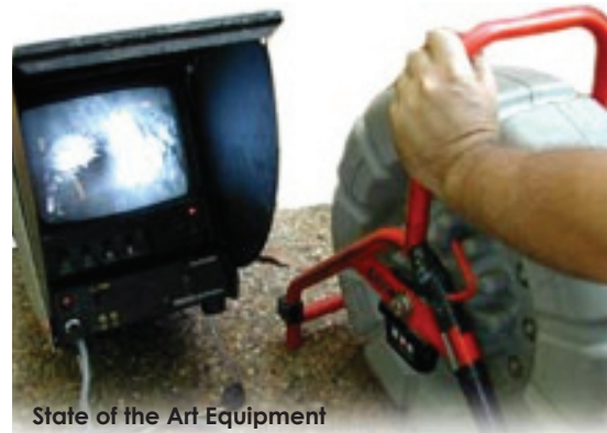
State of the Art Equipment