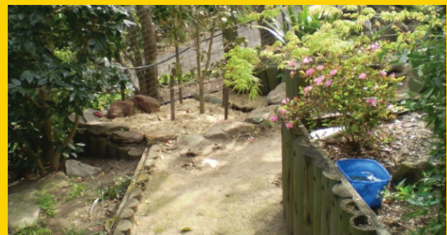
The completed job, apart from the white cap of the inspection opening you would hardly know a repair has been done.