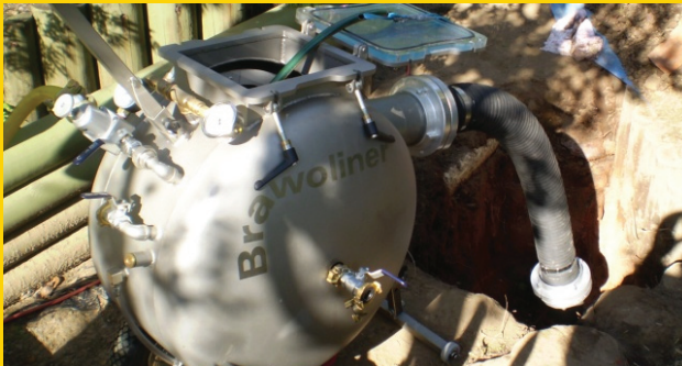
We excavate a keyhole and blow the new pipe liner into place with compressed air.