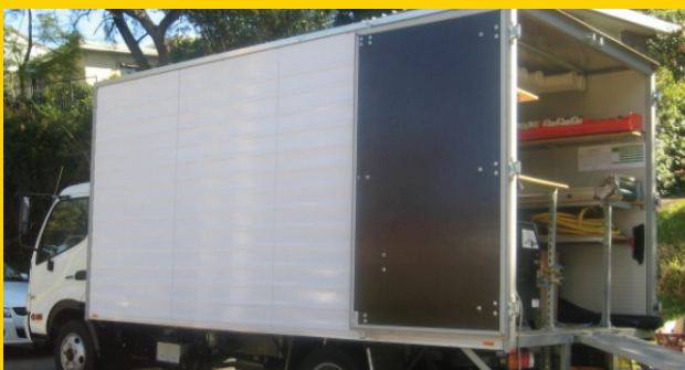
Relining truck fitted out with all the equipment necessary to complete the job.