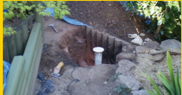
After the relining is complete an inspection opening is brought to the surface, landscaping is protected with drop sheets.