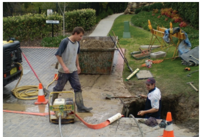
The optimum amount of resources allocated to your job.