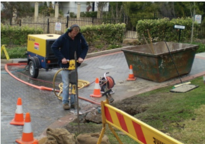
Well planned excavations with the right equipment.